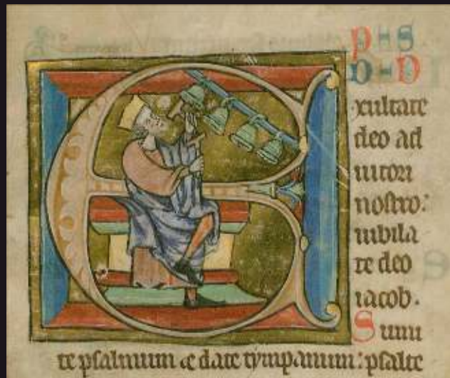
Bruges, PL, Ms. 8 f.77r; s.XIII: Psalter