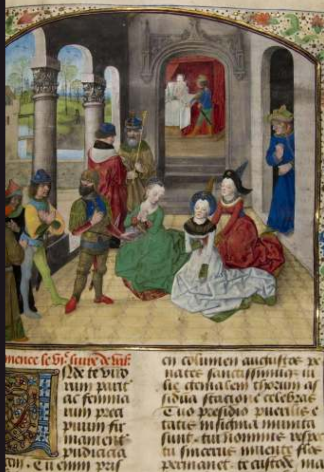
Bruges, MSem, Ms. 157/188 f.38r; s. XV; Valerius Maximus, Facta et dicta memorabilia