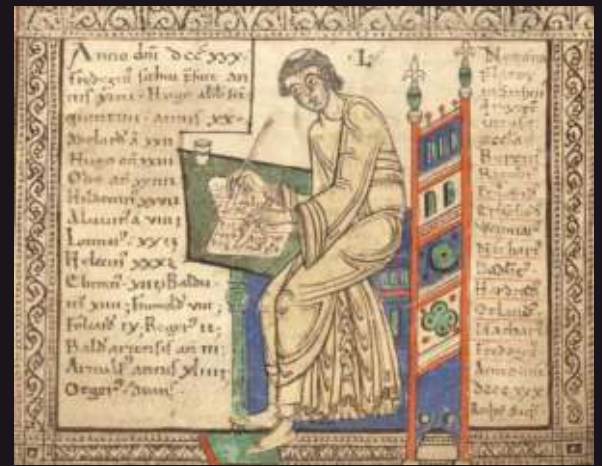
Ghent, UL, Ms. 92 f.13r; 1121; Lambertus a s. Audomaro, Liber floridus