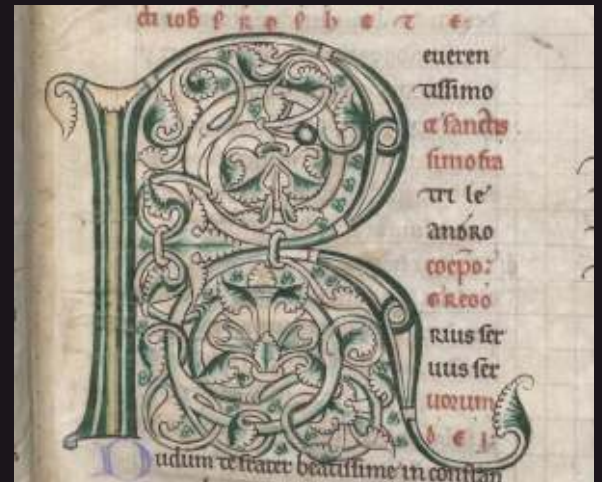
Bruges, PL, Ms. 140 f. 2r; ca.1200; Gregorius Magnus, Moralia in Job